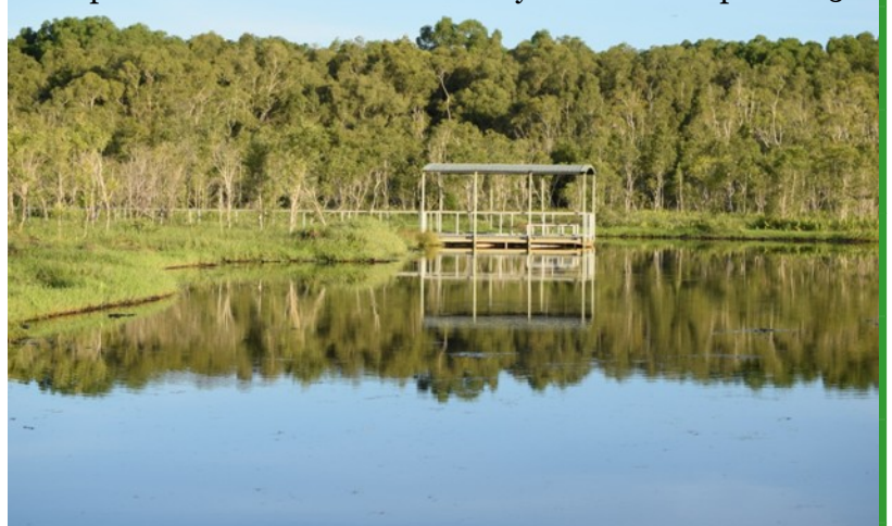
Open water once more: Waterlily lookout 20 April 2015

With assistance from other equipment for difficult areas, the harvester has cleared 6,000 to 7,000 square metres of an estimated 300,000 square metres vegetation along the causeway and lookouts. The Woodland to Water Lily boardwalk, to be re-opened later this year, now has clear water beside it. Although small in total, the area of opened water has made a huge visual difference and the number of birds on the dam has increased. We understand there were more migratory birds in early days of the dam. We're trying to obtain early birding data for the dam and monthly bird counts have commenced to monitor birdlife, thanks to Lyn and Brian Reid.