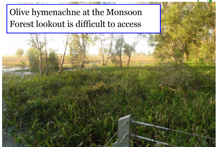
Olive hymenachne at the Monsoon Forest lookout is difficult to access