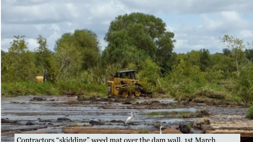
Contractors "skidding" weed mat over the dam wall, 1st March