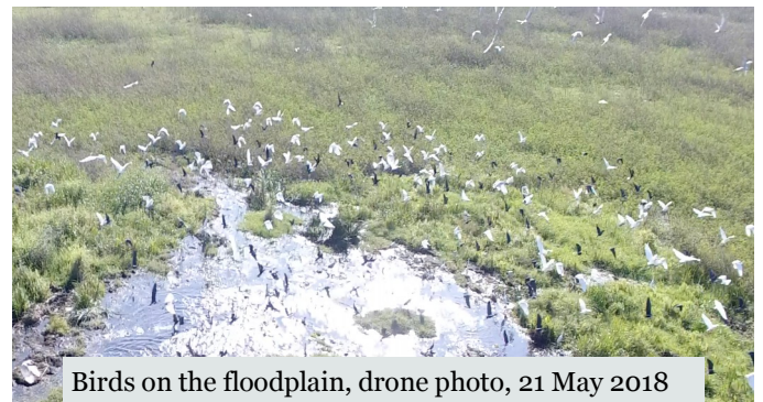
Birds on the floodplain, drone photo, 21 May 2018