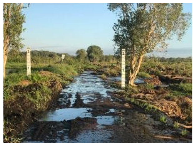
Weed mat banked-up against the causeway. Dam to the left.

With Fogg Dam full and overflowing, the Rangers and contractors were able to move lots of the dam's floating weed mat across the wall and onto the floodplain. While doing that, weed mat was banked against the wall to slow the flow of water and limit damage to the spillway.