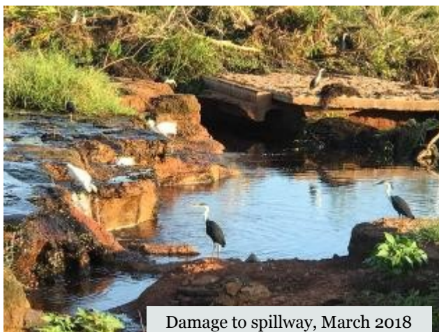
Damage to spillway, March 2018