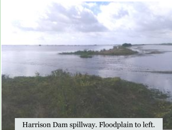
Harrison Dam spillway. Floodplain to left.

To the east of Anzac Parade, floodplain waters entered Harrison Dam and also blocked road access to Humpty Doo Barramundi farm.