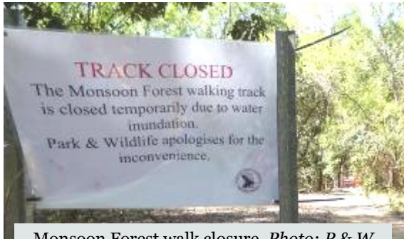
Monsoon Forest walk closure.

The flooding forced closure of the western side of the dam wall to traffic while for safety reasons both the Woodlands to Waterlily and the Monsoon Forest Walks were closed.