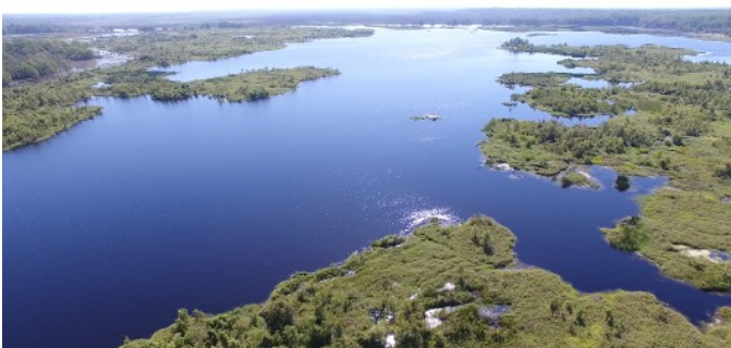
Dam: view towards causeway, drone photo, 17 June 2018

For a receipt to claim your deduction, please email details with your name, donation amount and date of donation to: info@foggdamfriends.org