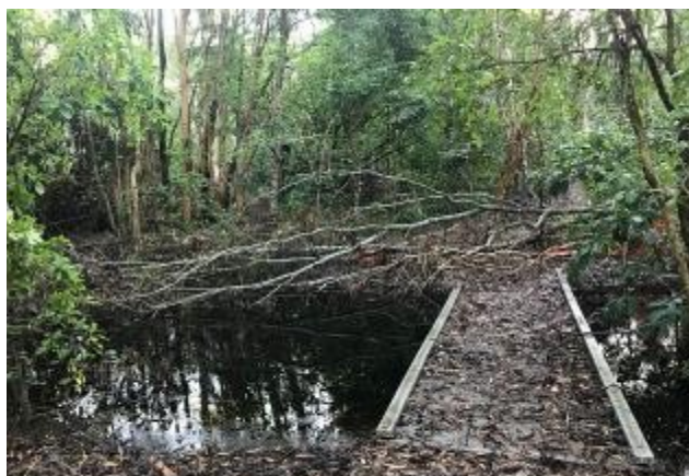
Entrance, Woodland to Waterlily Walk

We appreciate the work of the Fogg Dam Parks & Wildlife Rangers who have been working so hard to repair and clear the enormous damage that the wet season flood and Cyclone Marcus have caused. A massive task undertaken in difficult conditions.