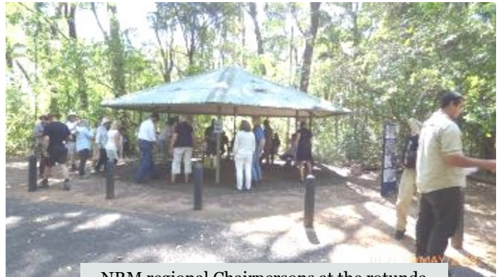
NRM regional Chairpersons at the rotunda

28 of the Chairpersons visited properties in the Middle Point area on Wednesday, May 23rd including Foggy Dam and Humpty Doo Barramundi. They were briefed on Foggy Dam Conservation Reserve and the work of FOFD and had morning tea at the Rotunda. Each was given a copy of the Rice Trail drivers' guide.