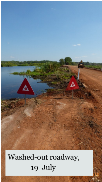
Washed-out roadway, 19 July

Repairs to the Fogg Dam wall commenced on 18 July. The gravelled area next to a wash-out of the bitumen roadway has been graded to provide access to Pandanus Lookout. The water level in the dam needs to fall further before the bitumen road can be repaired.