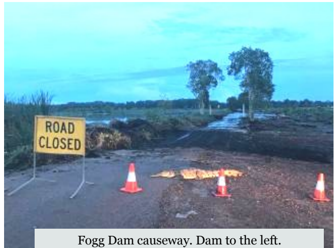
Fogg Dam causeway. Dam to the left.

To the east of Anzac Parade, floodplain waters entered Harrison Dam and also blocked road access to Humpty Doo Barramundi farm.