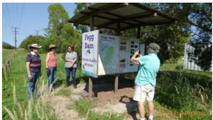
Some of the group at the Middle Point village information sign

Participants were provided with locality maps of the rice project and a drivers' guide to assist self-guided touring. This is available for download from FOFD's www.ricetrail.com.au website.