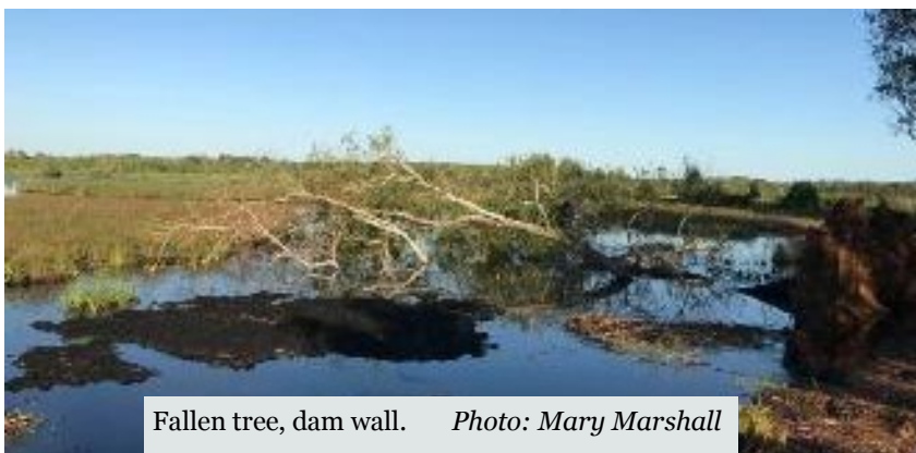
Fallen tree, dam wall.

With the ground already saturated, Category 2 Cyclone Marcus struck causing widespread damage to trees and power lines around Darwin. Fogg Dam suffered with 8 trees fallen beside the dam wall and large trees down along both walking tracks.