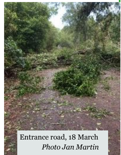
Entrance road, 18 March