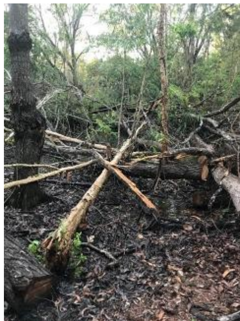
Woodland to Waterlily Walk