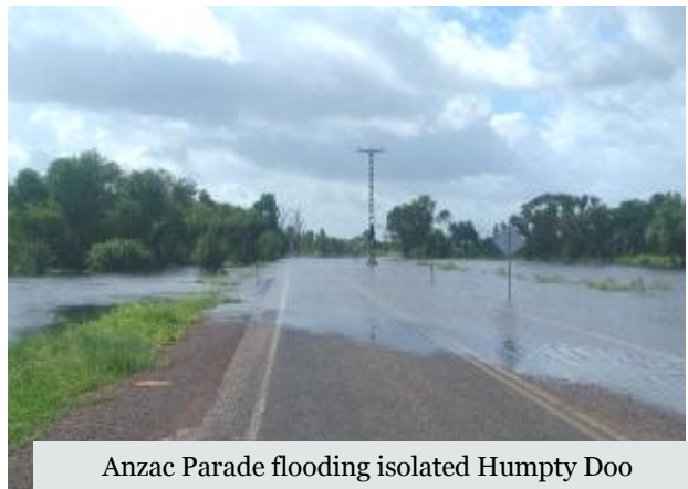
Anzac Parade flooding isolated Humpty Doo Barramundi farm

With Fogg Dam full and overflowing, the Rangers and contractors were able to move lots of the dam's floating weed mat across the wall and onto the floodplain. While doing that, weed mat was banked against the wall to slow the flow of water and limit damage to the spillway.