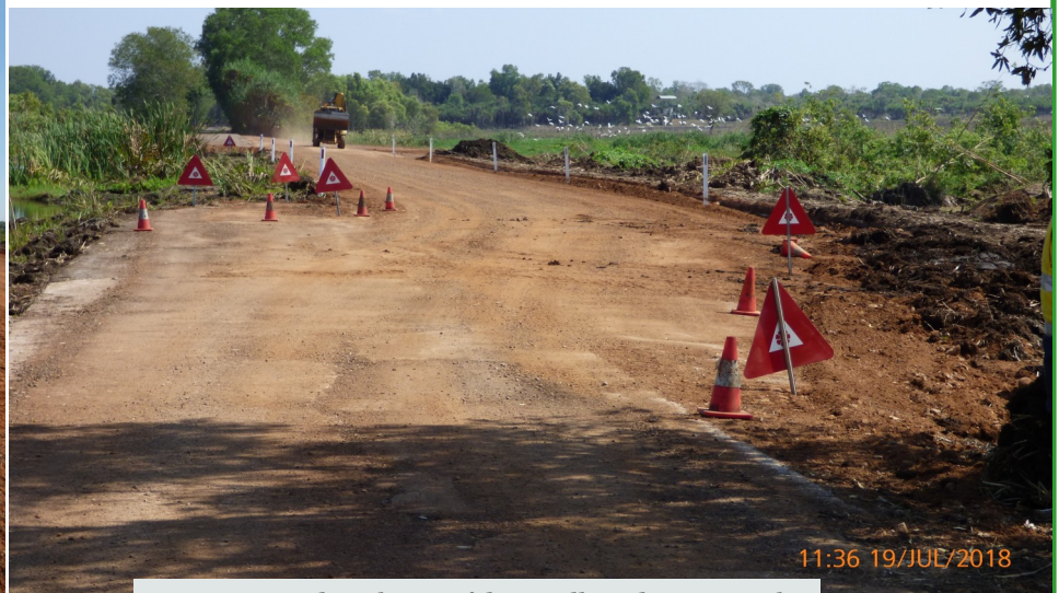
By-pass around wash-out of dam wall roadway, 19 July