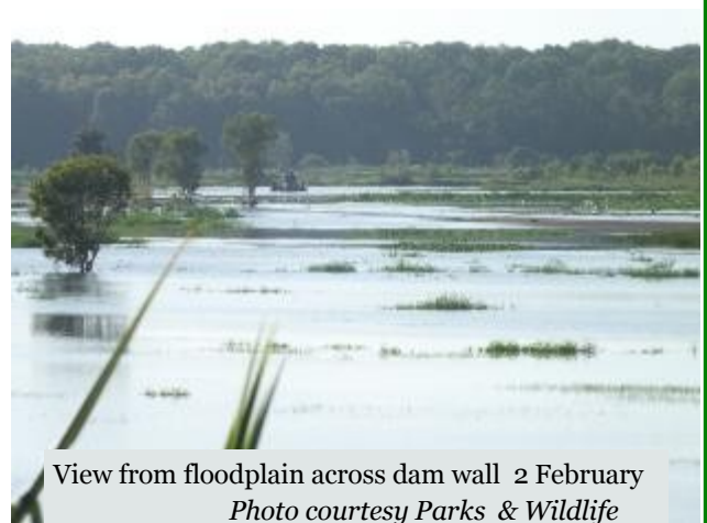
View from floodplain across dam wall 2 February